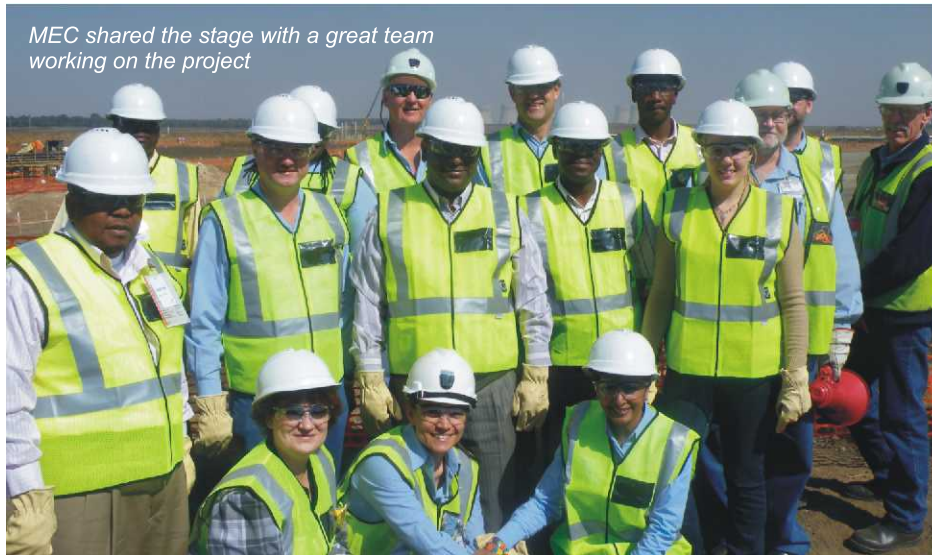
MEC shared the stage with a great team working on the project