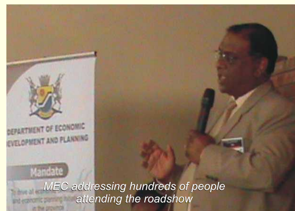
MEC addressing hundreds of people attending the roadshow