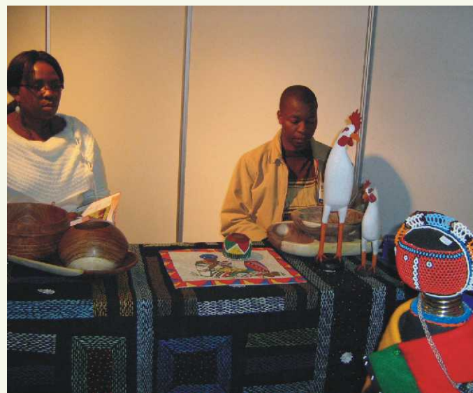
EXPO: Our officials sitting at their office stand representing all the products.