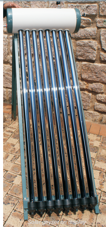
Solar geyser on display