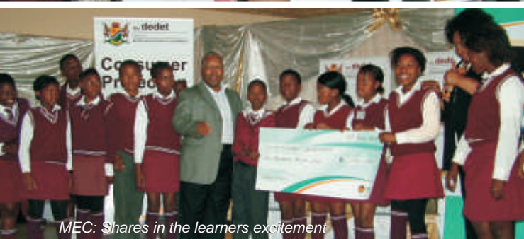
MEC: Shares in the learners excitement

In order to instil the culture of saving at an early age, the Department of Economic Development, Environment and Tourism ( the dedet ) and the First National Bank (FNB) joined hands to encourage learners in the Nkangala District.