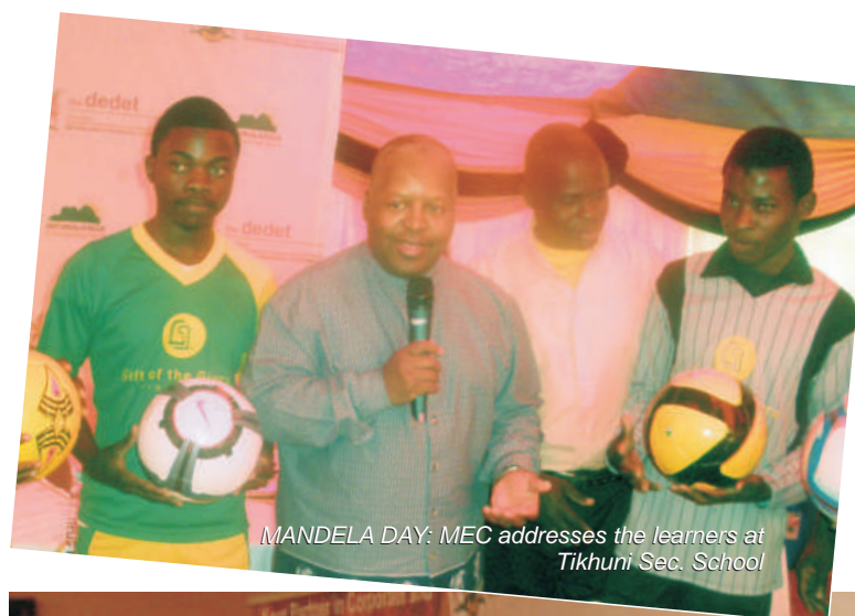
MANDELA DAY: MEC addresses the learners at Tikhuni Sec. School