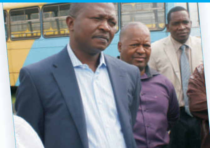
Premier DD Mabuza with MEC JL Mahlangu during a site visit in Wesselton, Ermelo

“ We have come here today to celebrate the fruits and sweat of the struggle. Today we can confidently say that South Africa is a democratic country that values human rights, the rule of law, democracy and liberties for all individuals and different groups”, said Premier DD Mabuza during the celebration of National Human Rights Day in Ermelo.