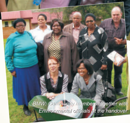
BMW: Community members together with Environmental officials at the handover

Although this programme has the potential to improve lives within the schools communities, it still remains the school's responsibility to do their share, in order for this shared vision to become a reality.