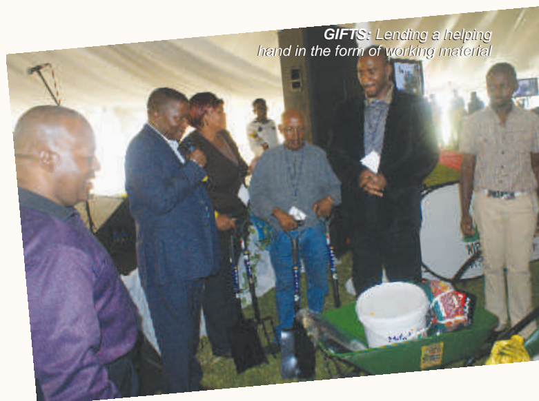
GIFTS: Lending a helping hand in the form of working material