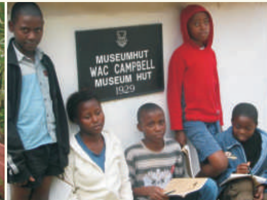
ATTENTION TO DETAIL: Children capturing every part of their experience