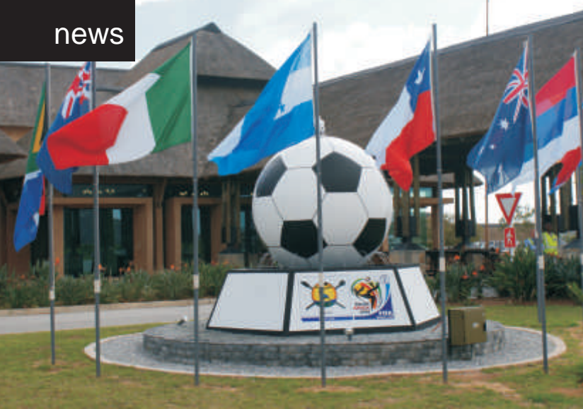
KMIA: Welcomes all nations to Mbombela