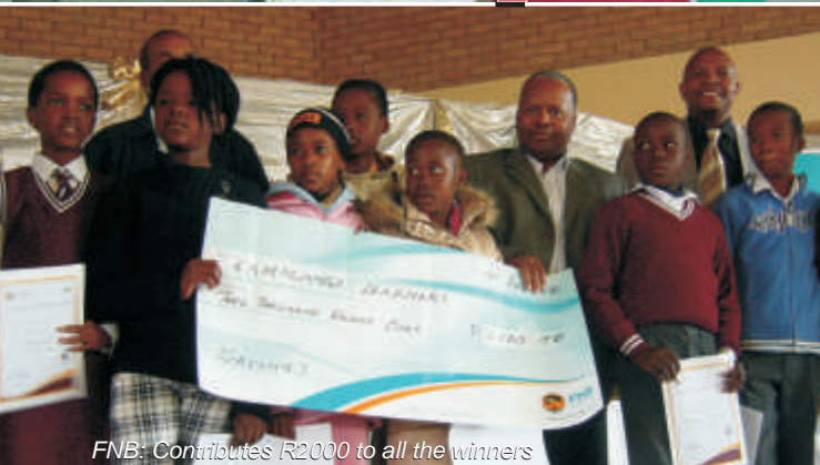
FNB: Contributes R2000 to all the winners