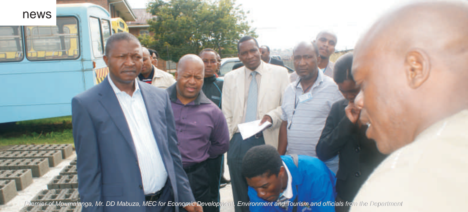
Premier of Mpumalanga, Mr. DD Mabuza, MEC for Economic Development, Environment and Tourism and officials from the Department