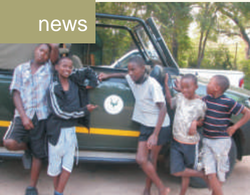
GAME DRIVE: Kids are excited and ready for departure