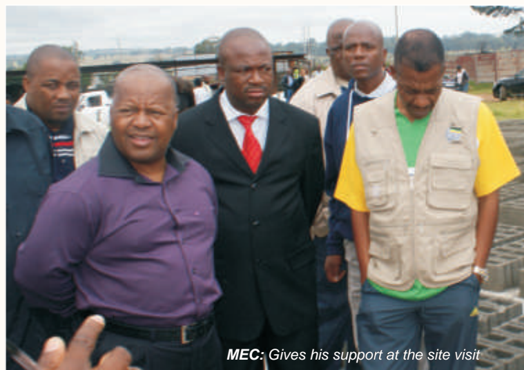
MEC: Gives his support at the site visit

“We, as South Africans, have to continue to work hard to restore peace, reconciliation and social unity among our people. We need to attend to the needs of the poor and continue to create a peaceful society,” he said.