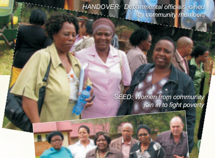
SEED: Women from community join in to fight poverty

For the past ten years the partnership between BMW South Africa and the dedet has been aiming to address poverty alleviation and to transfer skills to learners on conservation and greening. This partnership has grown substantially over the years, and many schools and communities have benefited from poverty alleviation in their respective areas.