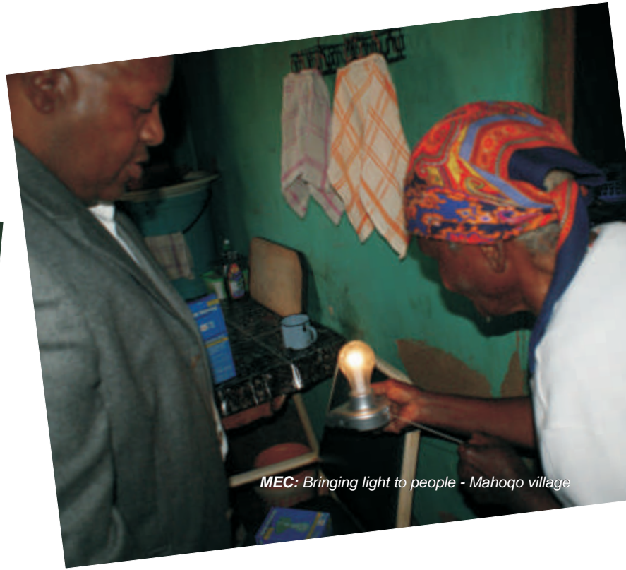
HANDOVER: MEC shares a few kind words with one of the local women