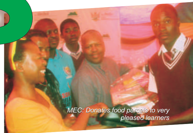
MEC: Donates food parcels to very pleased learners

The donations were made possible through partnership with the Mpumalanga Gambling Board; ICT Works; Buscor; Edcon group; Woolworths; Sneakers edition; Jacaranda FM; Bushbuckridge News; Nkomazi municipality; and media partners, Mpumalanga News and Ziwaphi newspapers who provided publicity for the initiative.