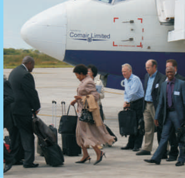
COMAIR: Lands at KMIA for the first time