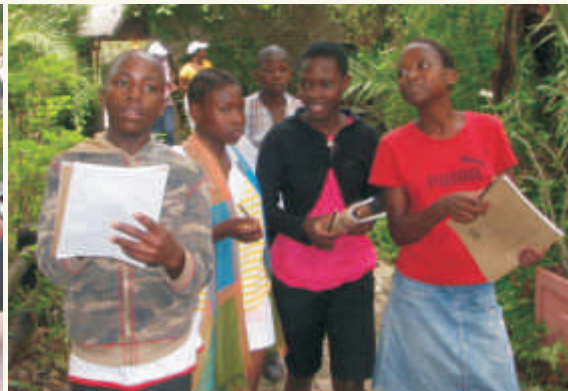
STORED HISTORY: Kids learning about the history of the KNP.