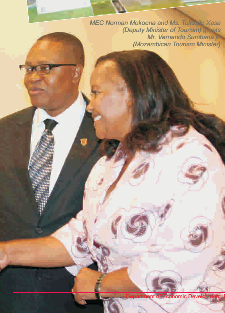
MEC Norman Mokoena and Ms. Tokozile Xasa (Deputy Minister of Tourism) greets Mr. Fernando Sumbana Jr. (Mozambican Tourism Minister)

Packages of projects were presented to the potential investors, giving them a picture of the current planned infrastructure plans, mainly in the tourism sector. Of the 15 projects presented, the province aims to develop a Blyde Cable Cars-transporting tourists from the top of the canyon to the peninsula in the middle of Blyde Dam. They also seek to develop the Byde Skywalke - a project that will take place at God's Window, allowing visitors a view of the Lowveld. The skywalk is a cantilevered glass walkway that protrudes from an elevated view point giving 360 degrees panoramic view. Another exciting project is the development of a World Class theme/ Amusement Park which will be located in the Loskop Area, and will create 2000 direct jobs and 6000 indirect jobs.