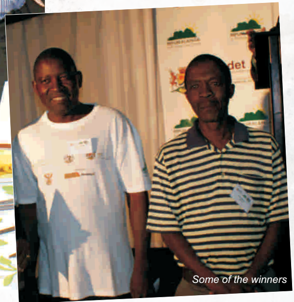
Some of the winners