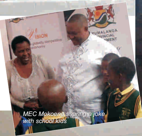
MEC Mokoena sharing a joke with school kids