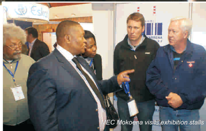
MEC Mokoena visits exhibition stalls

The plant, which will cost R169 Billion once completed in 2018, is expected to empower people of Nkangala District and Mpumalanga as a whole. It is expected to see the procurement process favouring established companies that will transfer their skills to the local entrepreneurs, and its tendering process made more accessible to the people from the province.