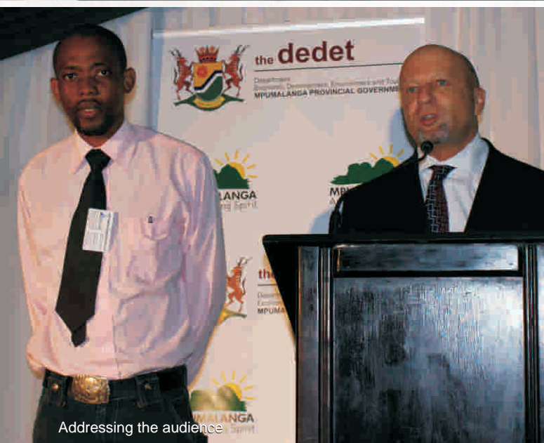
Addressing the audience

M pumalanga Provincial Government through the Department of Economic Development, Environment and Tourism launched the final year of the existence of the SMME Business Launchpad competition recently. The competition has produced promising Entrepreneurs since its inception in 2008.