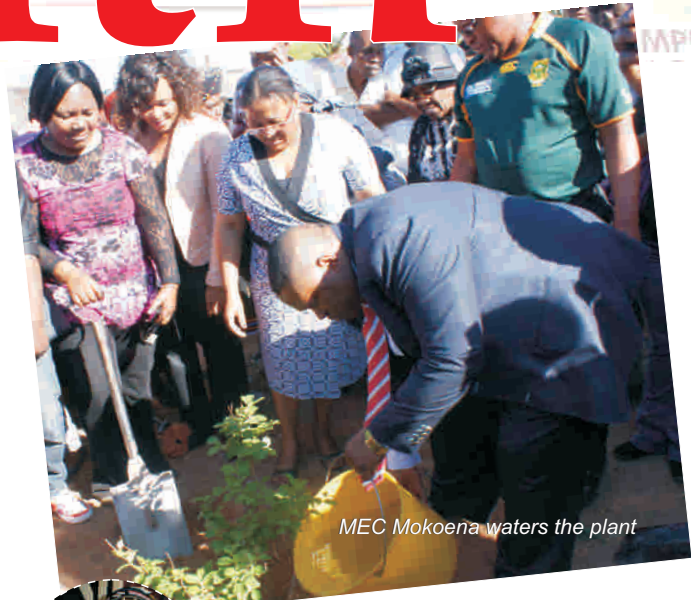
MEC Mokoena waters the plant

Other events that took place during the auspicious of the tourism month include the media tour, where journalist and tourism ambassadors toured to the following areas in the province, Rock & Roll in Mkhuhlu Township where they had an opportunity to interact with their fans, as well as visiting the three rondavels.