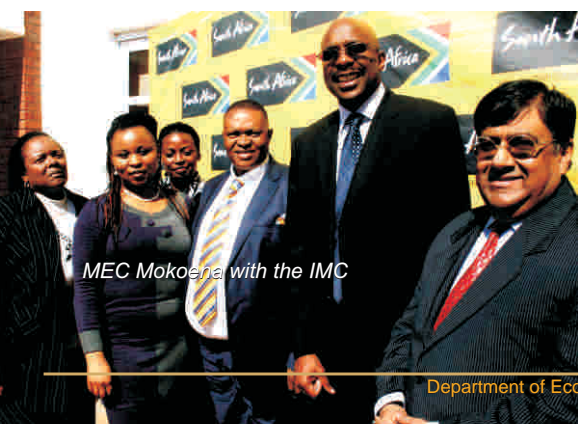
MEC Mokoena with the IMC

We urge the people of Mpumalanga to play an active role in whatever manner possible to promote the brand South Africa.