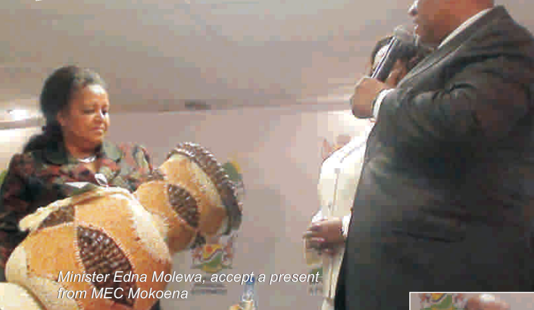
Minister Edna Molewa, accept a present from MEC Mokoena