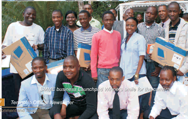
SIMME business Launchpad Winners smile for the camera