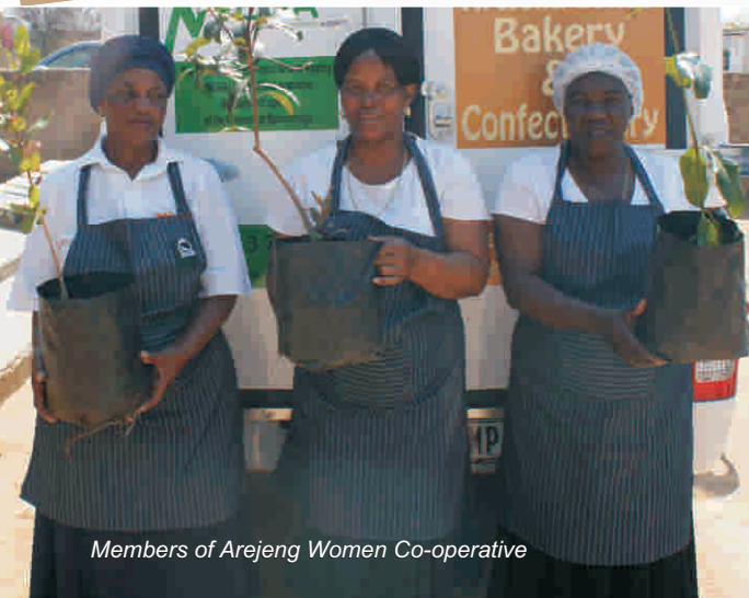
Members of Arejeng Women Co-operative