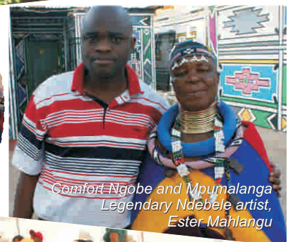
Comfort Ngobe and Mpumalanga Legendary Ndebele artist, Ester Mahlangu