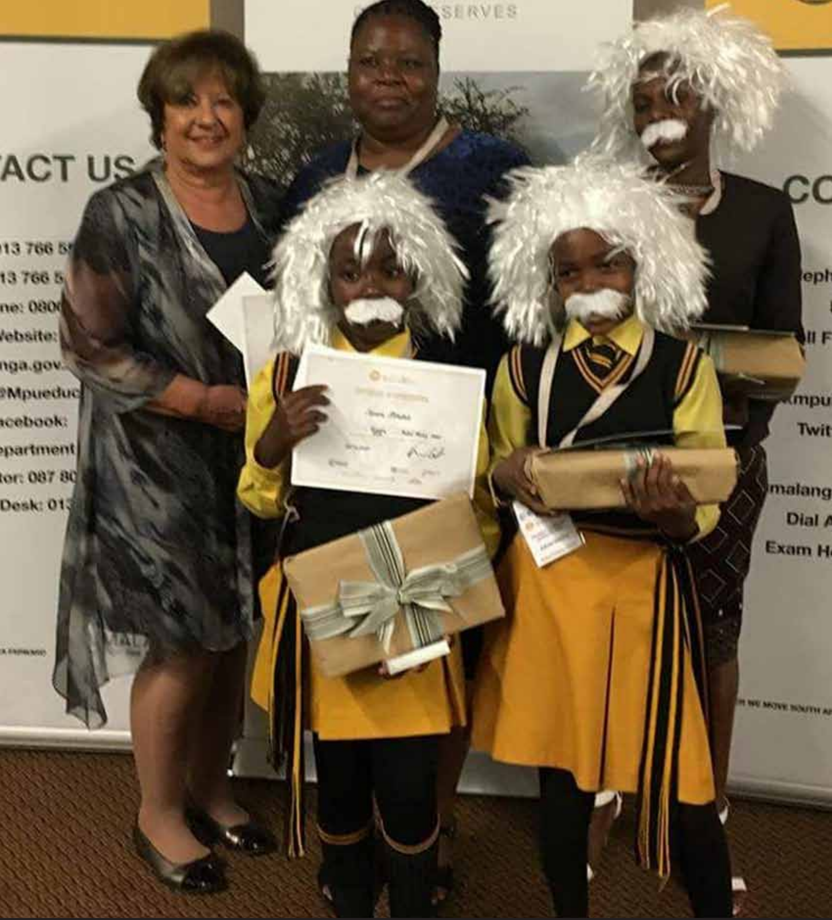
Congratulations to Babati Primary School