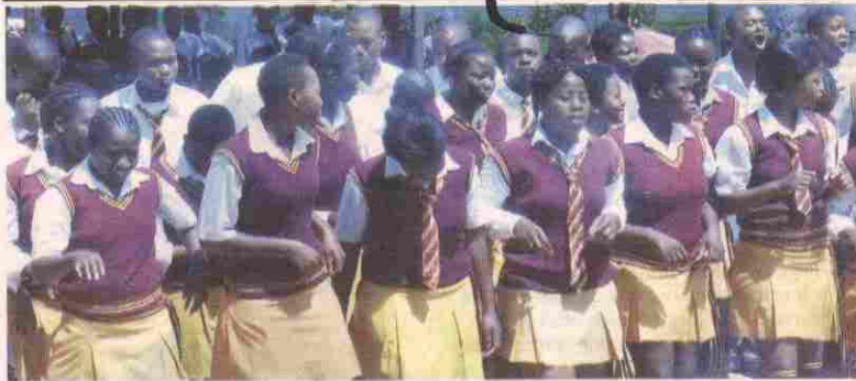
The Phatfwa school choir entertaining guests.