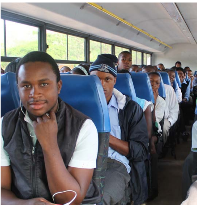
ALWAYS PUNCTUAL: Cyril Clarke learners who will benefit from the scholar transport buses.