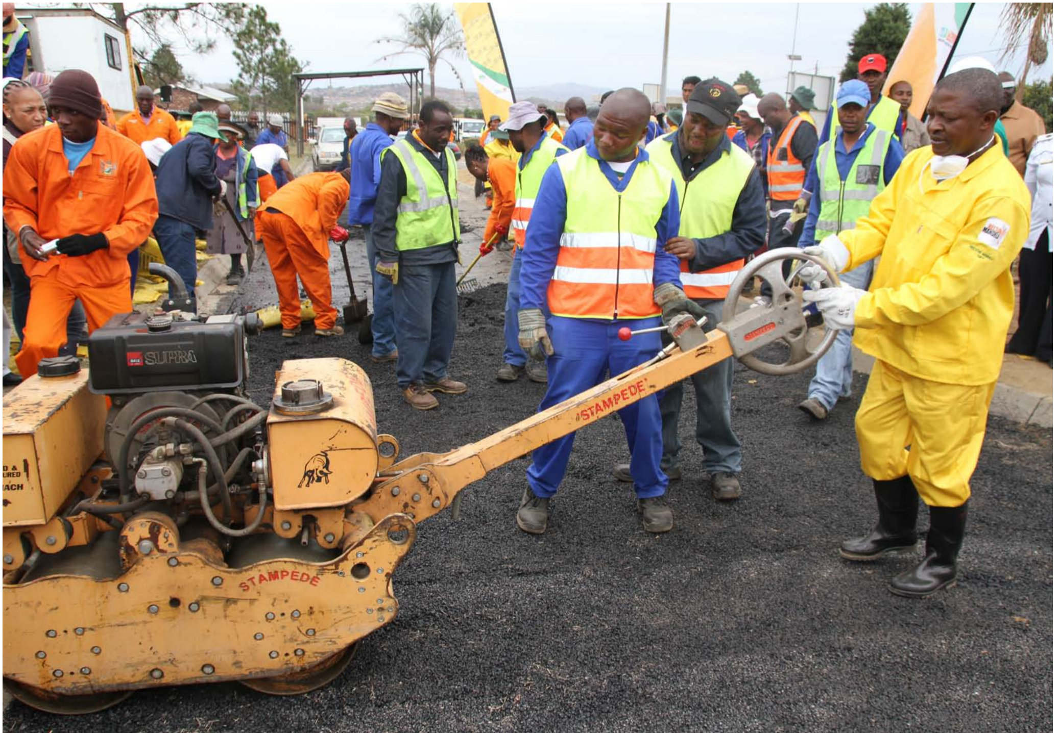
MINUTES WELL SPENT: Fixing the road that leads to Embhuleni Hospital during Nelson Mandela Day, Premier David Mabuza demonstrated that all South Africans should work together to do good.