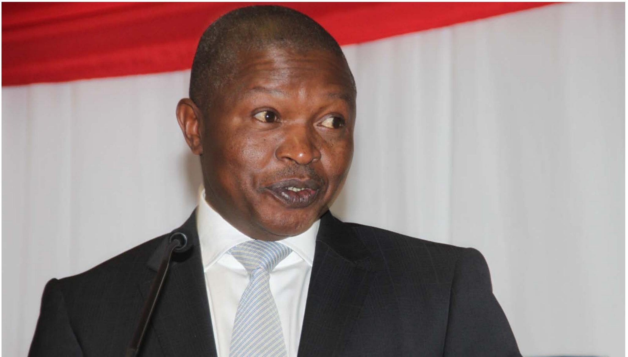
ADDRESSING THE MPAC SITING: Premier David Mabuza chairs his first sitting at the Mpumalanga Provincial Aids Council.