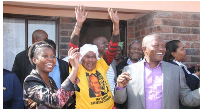
FULFILLING THE PROMISE: Premier David Mabuza handing over houses to the residents of Thembisile Hani Local Municipality this is in line with his vision of fast tracking service delivery in the province.