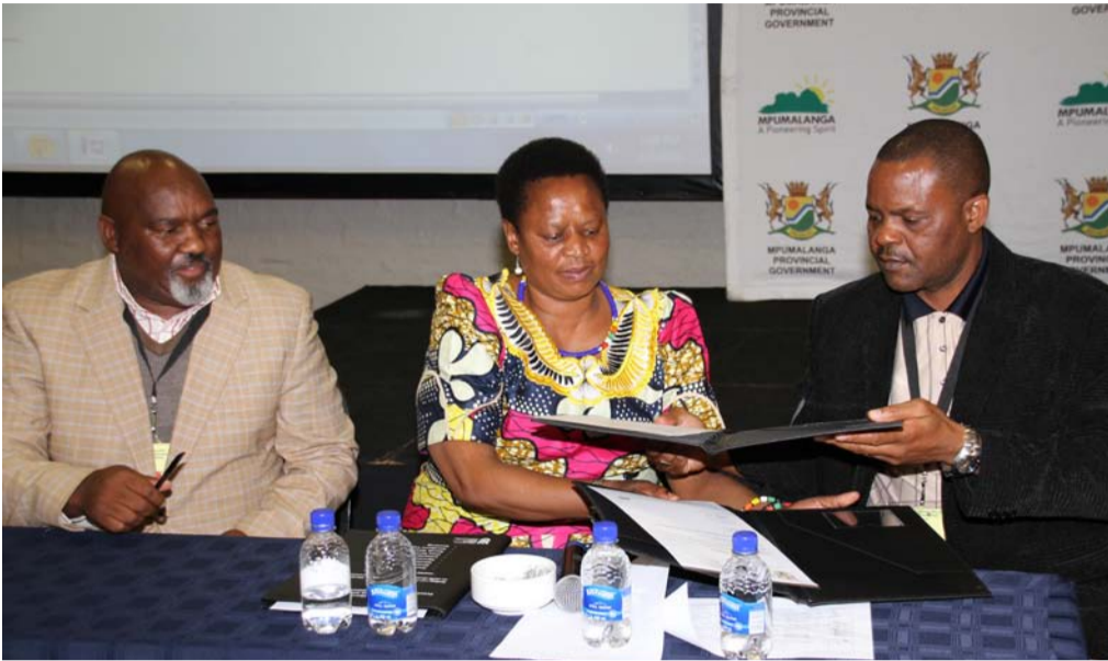
Intensifying the training sector: MEC of Education Regina Mhaule signing a declaration with SETA members.