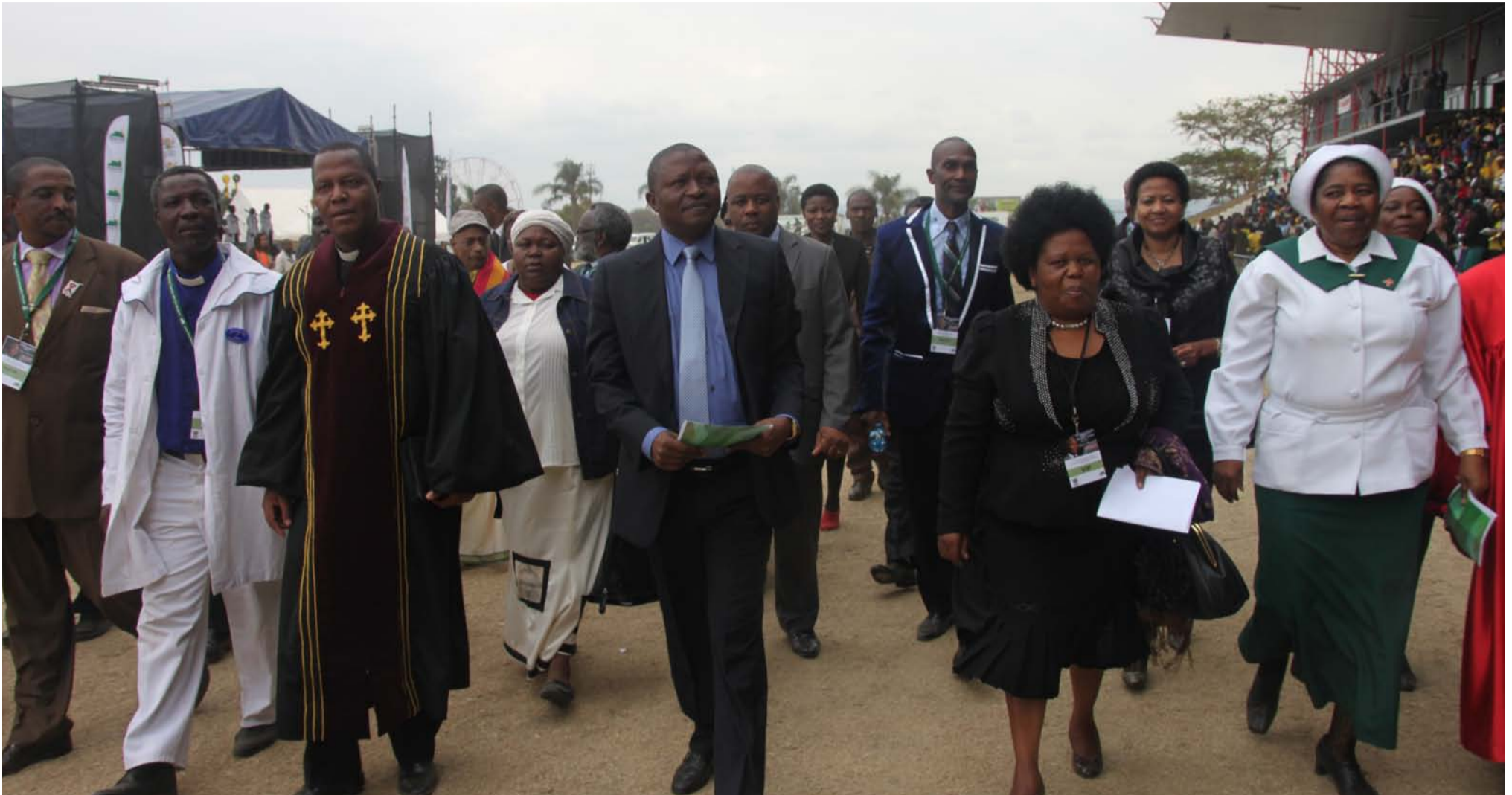
PRAYER MEETING: Premier David Mabuza fellowships with his cabinet, various religious leaders and members of the public in a prayer service held in honour of the former national President Nelson Mandela.