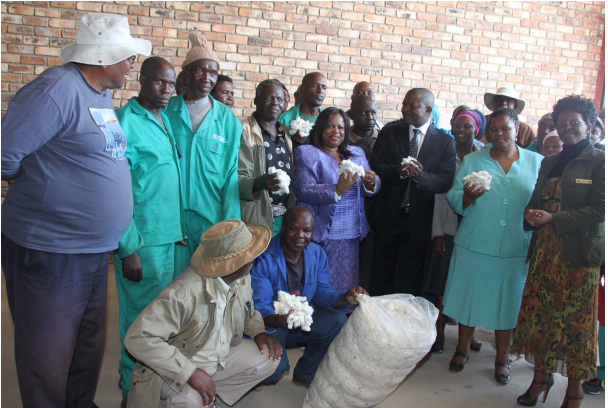
REAPING THE REWARDS: Premier David Mabuza and MEC of Agriculture, Rural Development and Land Administration Violet Sewela visiting Kotokwane Fresh Produce, a cotton and maize meal farming project in Marapyane.