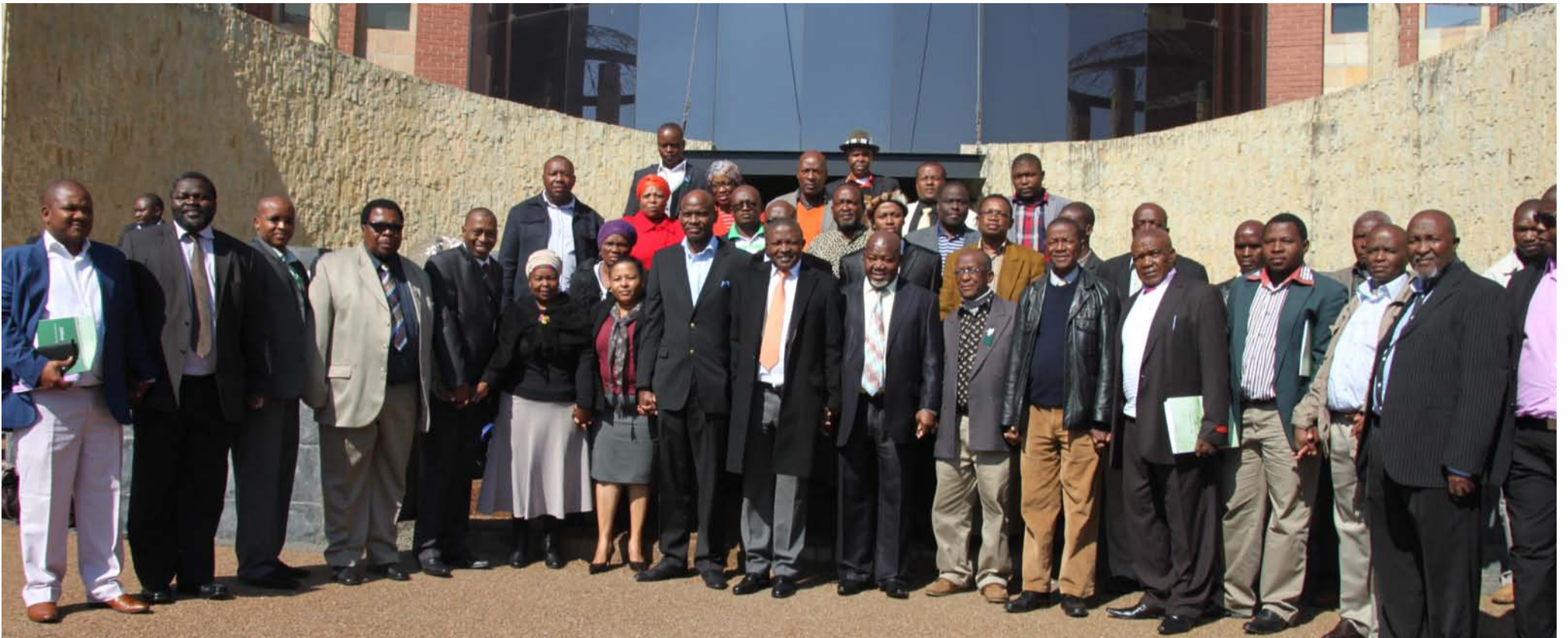
JOINING HANDS: Premier David Mabuza joining hands with traditional leaders in Middleburg to symbolise solidarity in fighting the scourge of HIV and Aids.