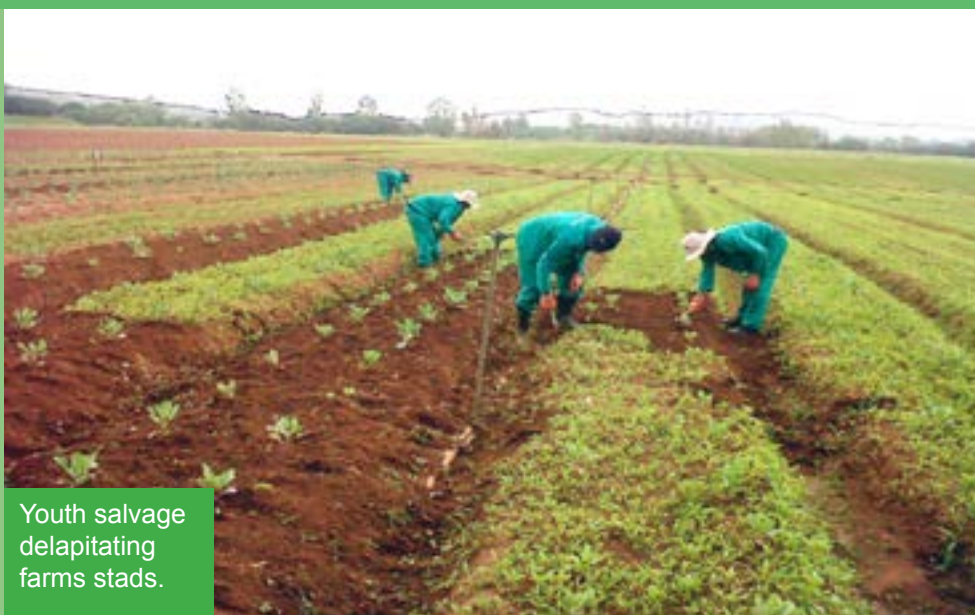
Youth salvage delapidating farms stads.