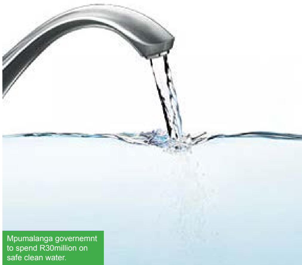
Mpumalanga government to spend R30million on safe clean water.

“The domestic violence perpetrated against women and girl children require that all the citizens of the province take a stand and say NO TO ABUSERS.” He said that society needed to address some of the root causes of these crimes such as poverty, unemployment and inequality, particularly youth unemployment. “As a province, we shall work with all law enforcement agencies and communities to take the fight against crime back to