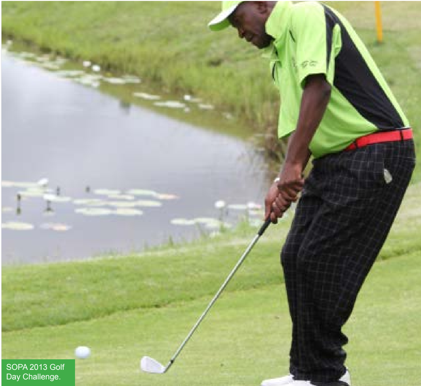
SOPA 2013 Golf Day Challenge.