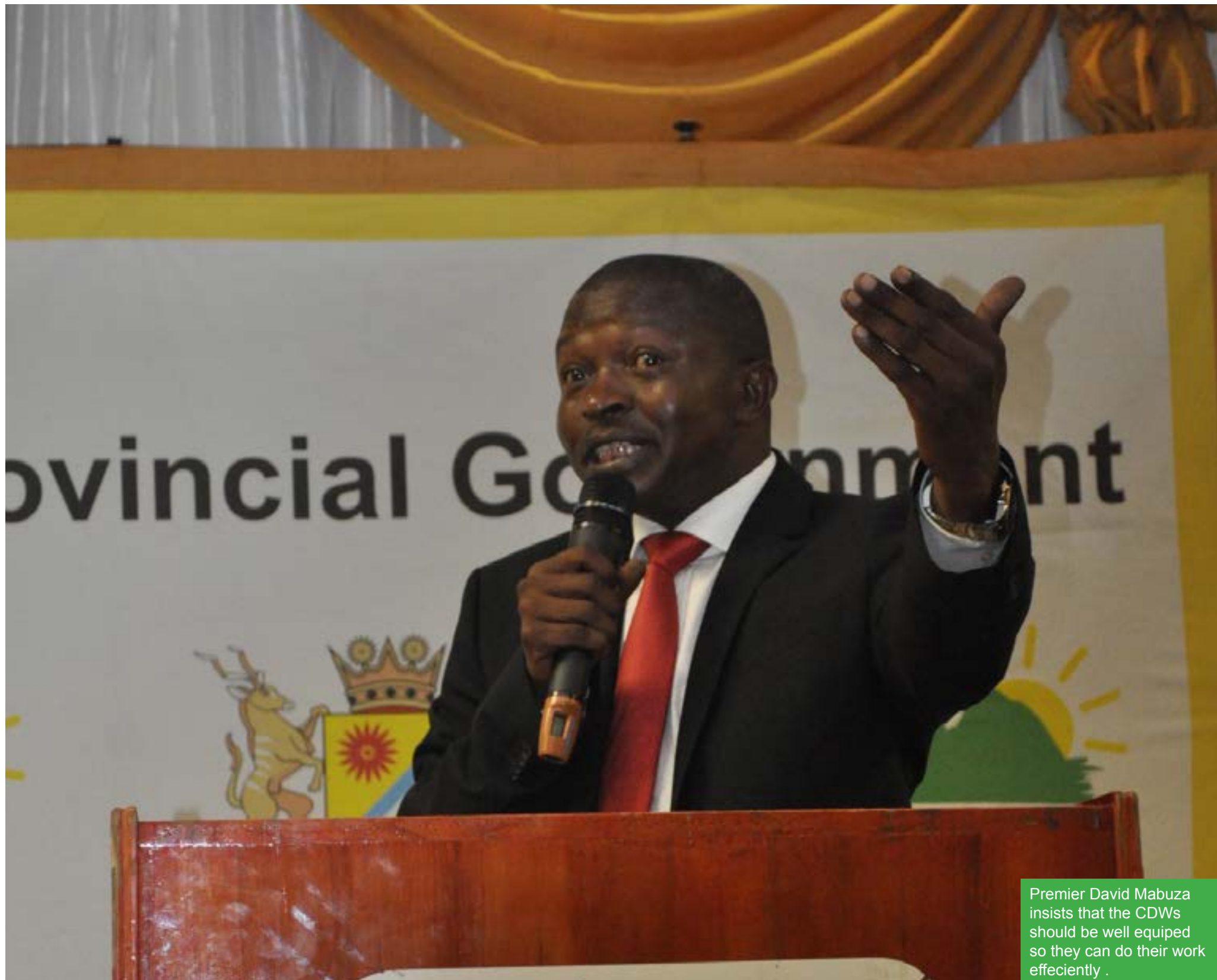
Premier David Mabuza insists that the CDWs should be well equipped so they can do their work efficiently.