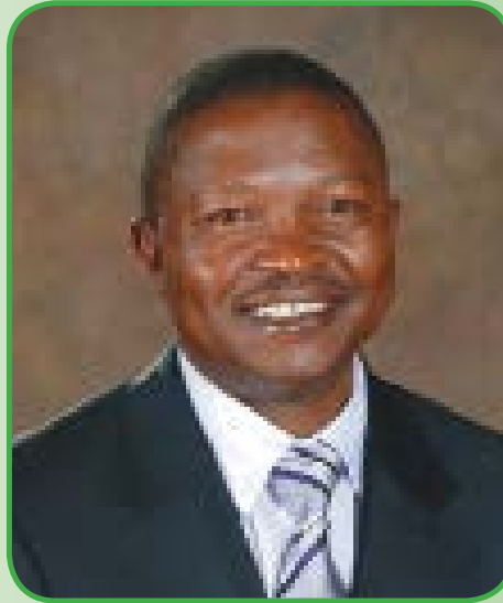
Hon. Mr David Mabuza Premier of Mpumalanga Province