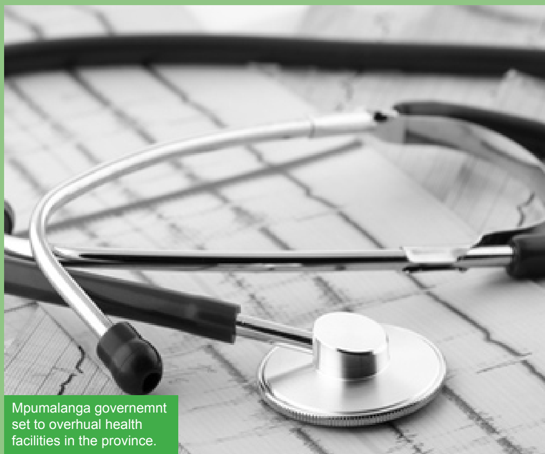
Mpumalanga government set to overhaul health facilities in the province.

T he Mpumalanga government is to demolish old hospitals that pose a danger to patients and staff. Premier David Mabuza said they were investing a large proportion of resources to deliver quality health care to the citizens of the province. “We are doing this to ensure that our healthcare system is able deliver quality healthcare to all, including the poor and vulnerable sectors of our society.” Mabuza said their assessment of hospital performance indicated that there were hospitals that are so old and dilapidated that they pose a serious danger to the lives of patients they are meant to help. “Any form of continued maintenance will constitute a serious waste of resources. We have come to the conclusion that these hospitals need to be completely demolished and reconstructed,” he said.