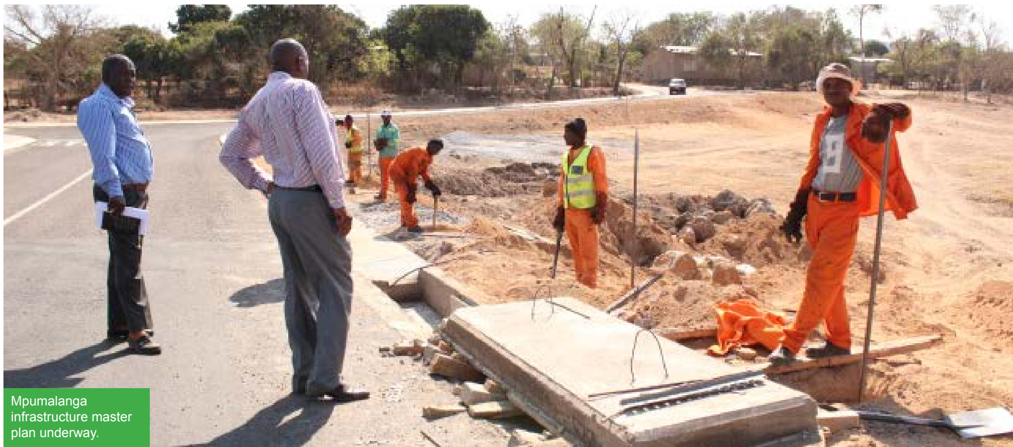
Mpumalanga infrastructure master plan underway.