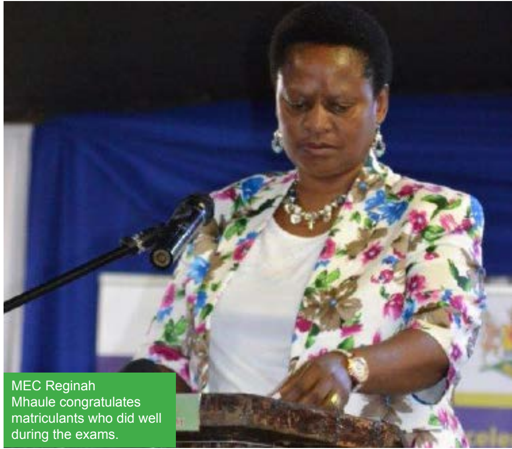
MEC Reginah Mhaule congratulates matriculants who did well during the exams.

The Mpumalanga provincial districts also improved with Ehlanzeni District