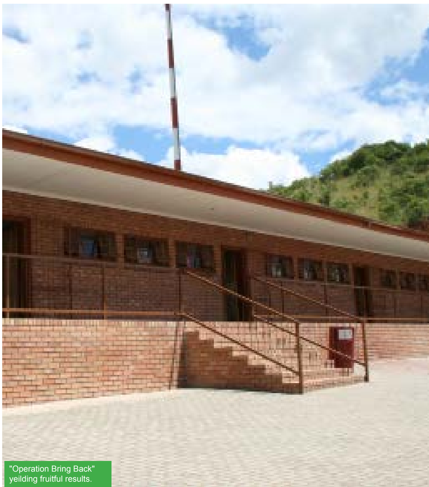
"Operation Bring Back" yielding fruitful results.

Make good communities better and progressive. This manifests that working together; we can drive back unemployment and reduce economic inequality and poverty. - Mbalenhle Mhlongo