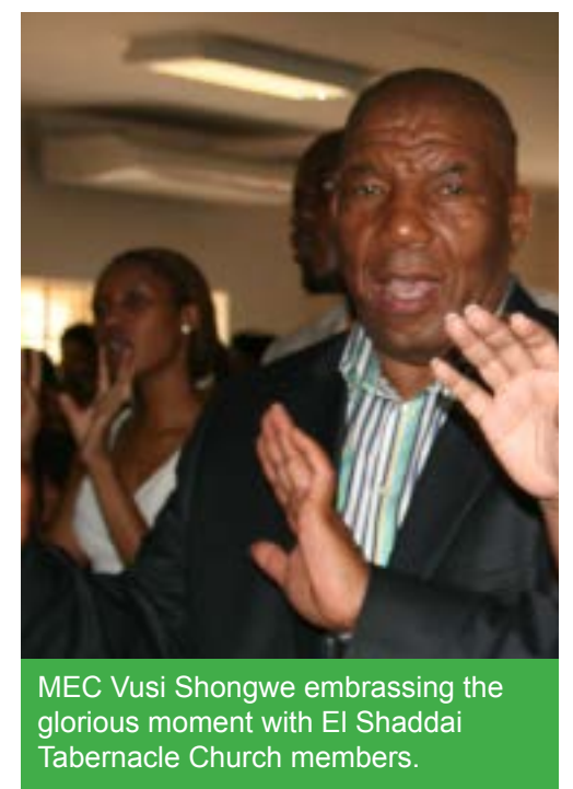
MEC Vusi Shongwe embracing the glorious moment with El Shaddai Tabernacle Church members.

women are being abused by rogue elements who are living amongst us but instead will take a stand against barbaric acts of abusing and killing innocent children," Mdakane said. Mdakane has also promised that his church will continuously pray for the government of the day and assists with building of vibrant, caring and morally sound societies.