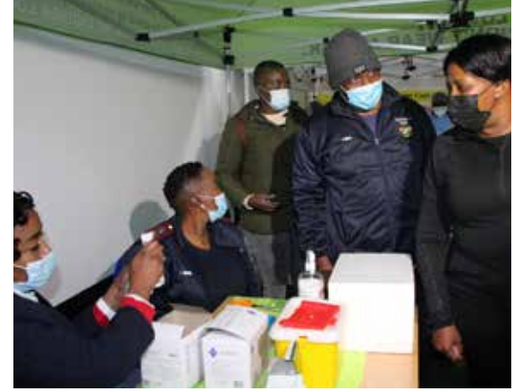
Workers ancipating to receive their first Covid 19 vaccines doses.

its occupational health and safety strategy, she said that it was a good initiative which should be inculcated to other mines.