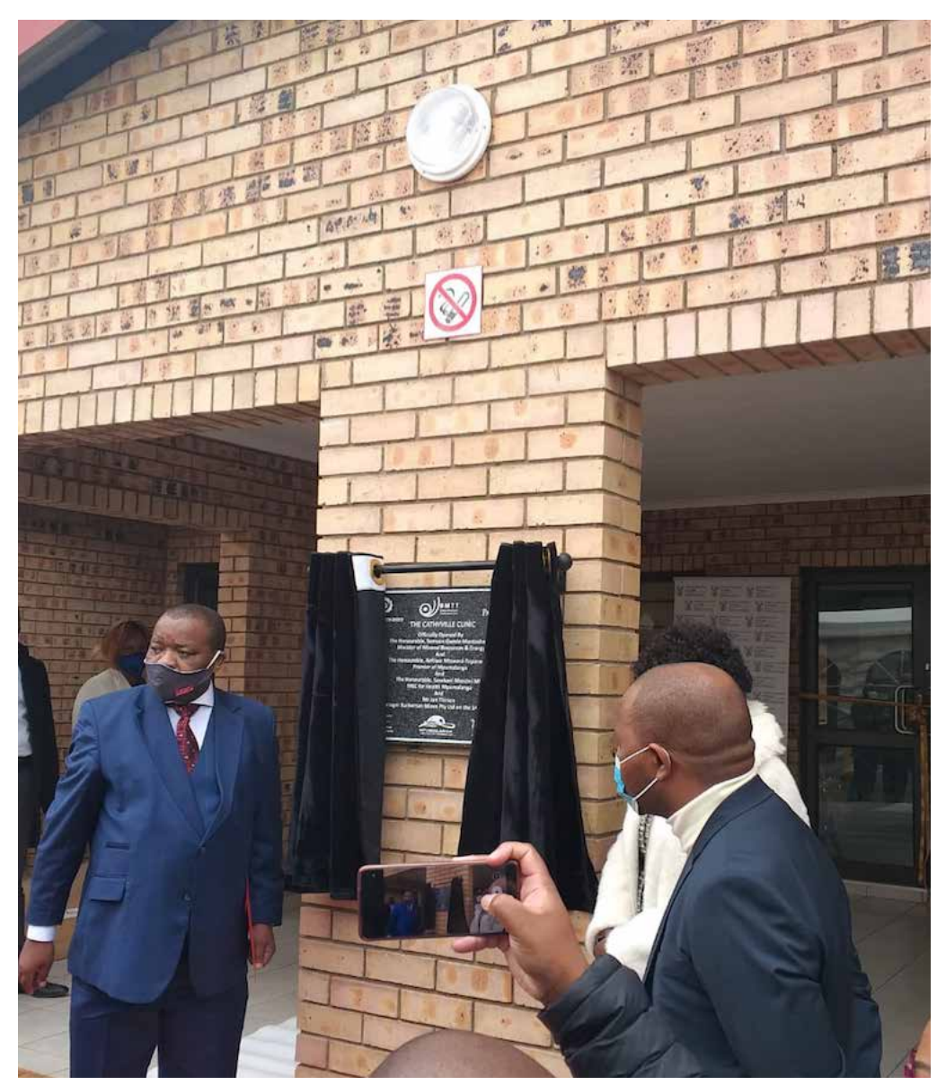
Handover of the state of the art clinic and energy packs at Mjindini by the Mineral Resources and Energy Minister, Mr Gwede Mantashe and Mpumalanga Premier Ms Refilwe Mtshweni to the community.

Meanwhile, three households were provided with energy starter packs. The houses are part of an electrification project in which 3000 were electrified at Umjindini by the Department of Minerals Resources and Energy.