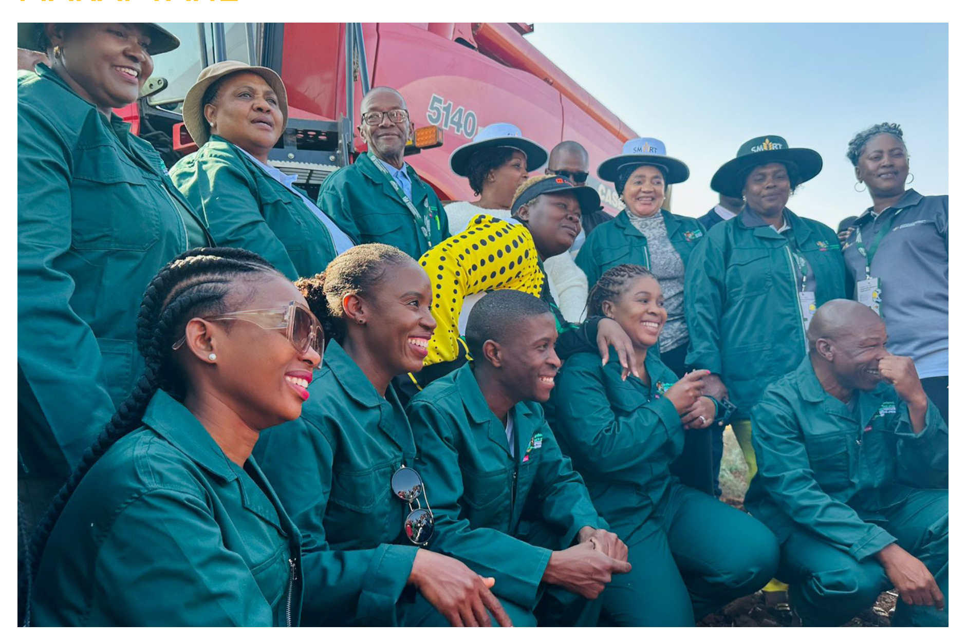
Members of the Bakgatla Coops in Marapyane share a lighter moment during the official launch of the grain project.

A grain project has created over 100 temporary jobs for the locals in Marapyane, in Dr JS Moroka Local Municipality. The project started as a concept in 2016 by a group of farmers, the Marapyane Bakgatla Primary Cooperative. It is one of the broad range of projects supported by the Mpumalanga Provincial Government for jobs massification and food security.