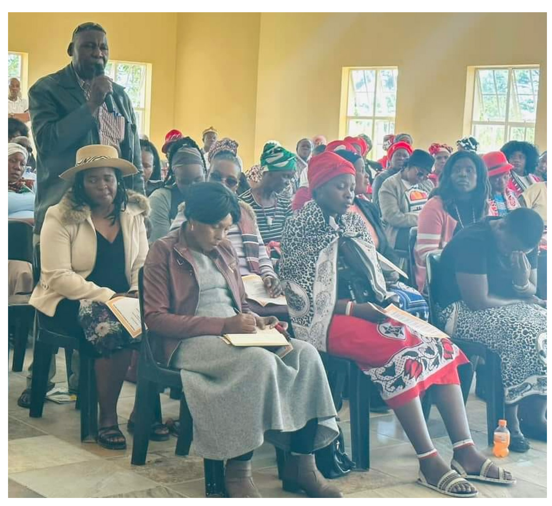
Traditional healers gathered at the offices of the Malele Traditional Council to engage MEC Manzini.

There are more than 200 000 traditional healers across South Africa, many of whom are located in rural areas. This suggests that some of them are accounted as citizens of Mpumalanga, one of the Provinces with a rural profile.