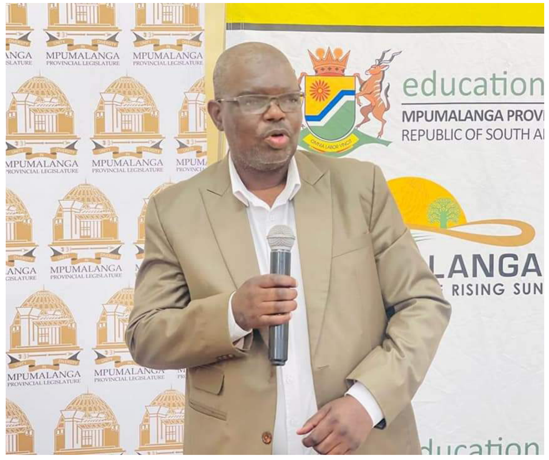
MEC Majuba congratulates Mpumalanga graduates who studied in the Russian Universities.

The rural profile of Mpumalanga, costs the Province valuable skills. Many people in a broad range of specialised fields are attracted to other areas that are urban, leaving Mpumalanga to grapple with a brain drain of skills.