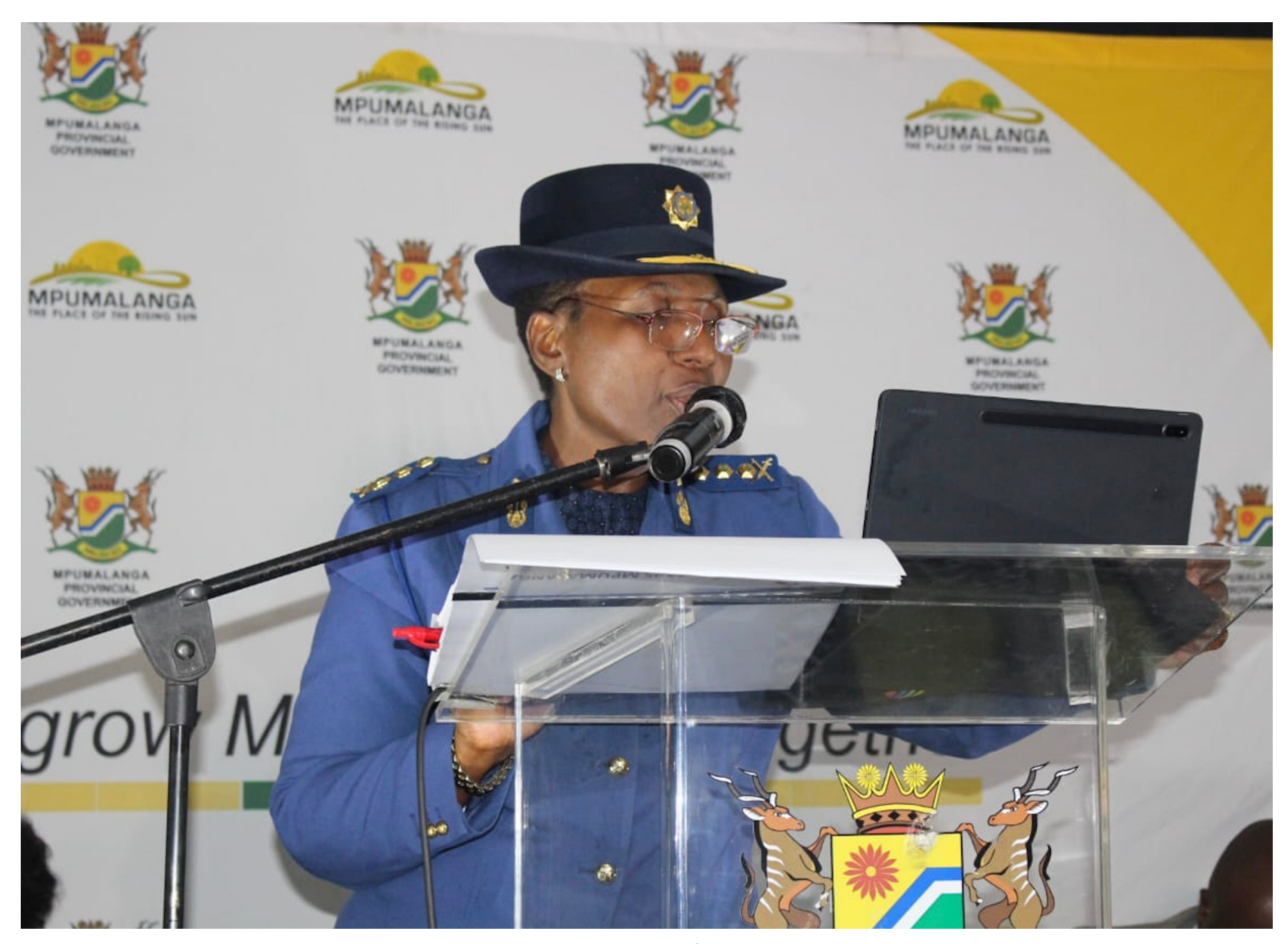
Mpumalanga Provincial Commissioner, Lt- General, Seakamela paints a picture of crime statistics in the summit.

A two-day CRIME PREVENTION SUMMIT was held in Quarter 1 of 2023-24 financial year to intensify crime prevention measures . Crime is a scourge in the country and Mpumalanga is pulling out all stops to eradicate it.