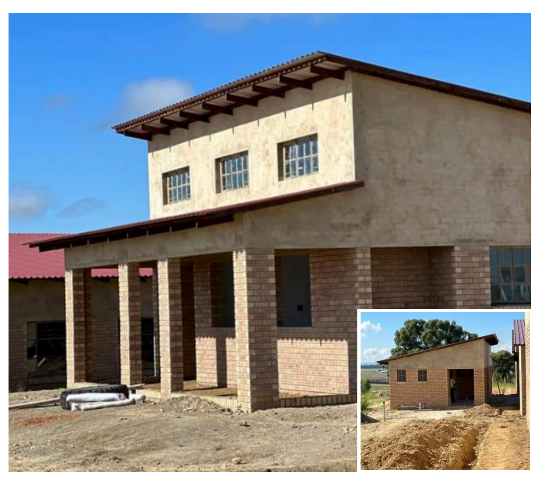
Construction of the New Ermelo School is at the tail end.

Teaching and learning will soon take place at the New Ermelo Primary School in Msukaligwa Local Municipality. This as the Department of Education in Mpumalanga put final touches to the construction of the new school. The construction process is currently at 75% towards completion.