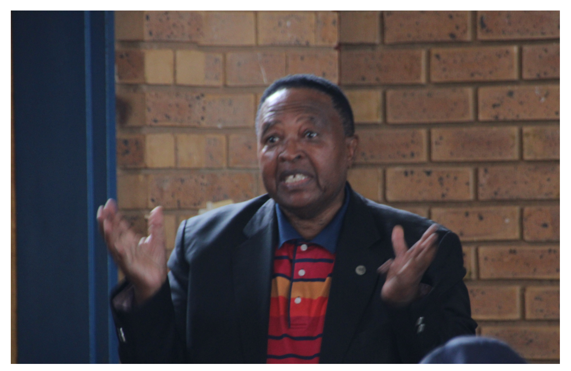
Residents share their aspirations in Thembisile Hani Municipality.

Thembisile Hani Local Municipality is one of the poorest municipalities in Mpumalanga. Unemployment is at 60.1%, according to the 2021 Stats SA figures. Access to water, health services, damaged road infrastructure and a high unemployment rate were raised sharply by the residents when the Provincial Legislature conducted a public engagement programme, Taking Legislature to the People (TLP) recently.