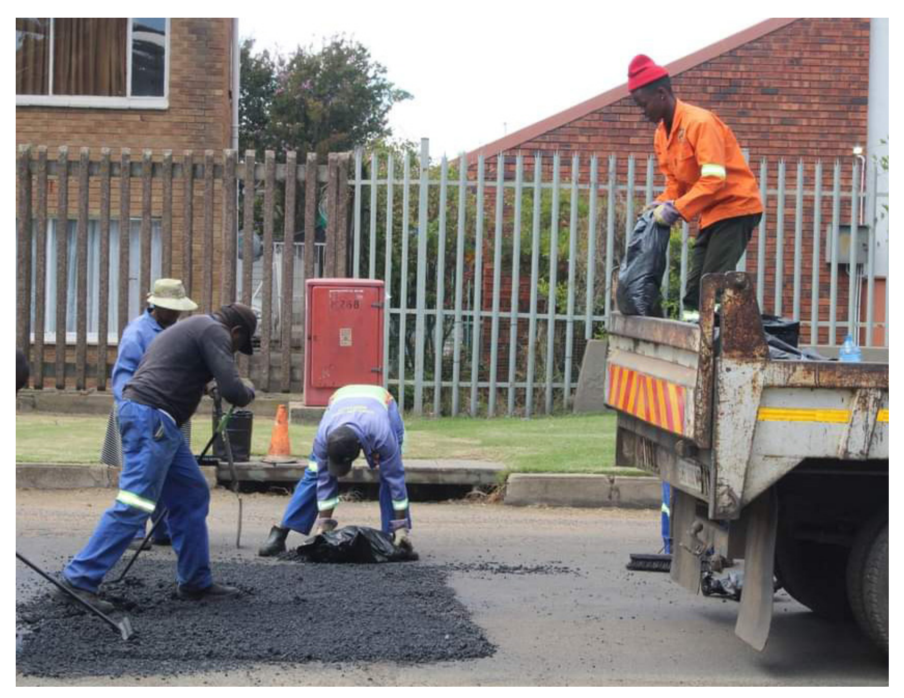
Msukaligwa Local Municipality has declared war on potholes.

It is all hands on deck as Municipalities in Mpumalanga embark on aggressive campaigns to accelerate service delivery. The campaigns include improvement of the infrastructure, clean environment and waste collection.