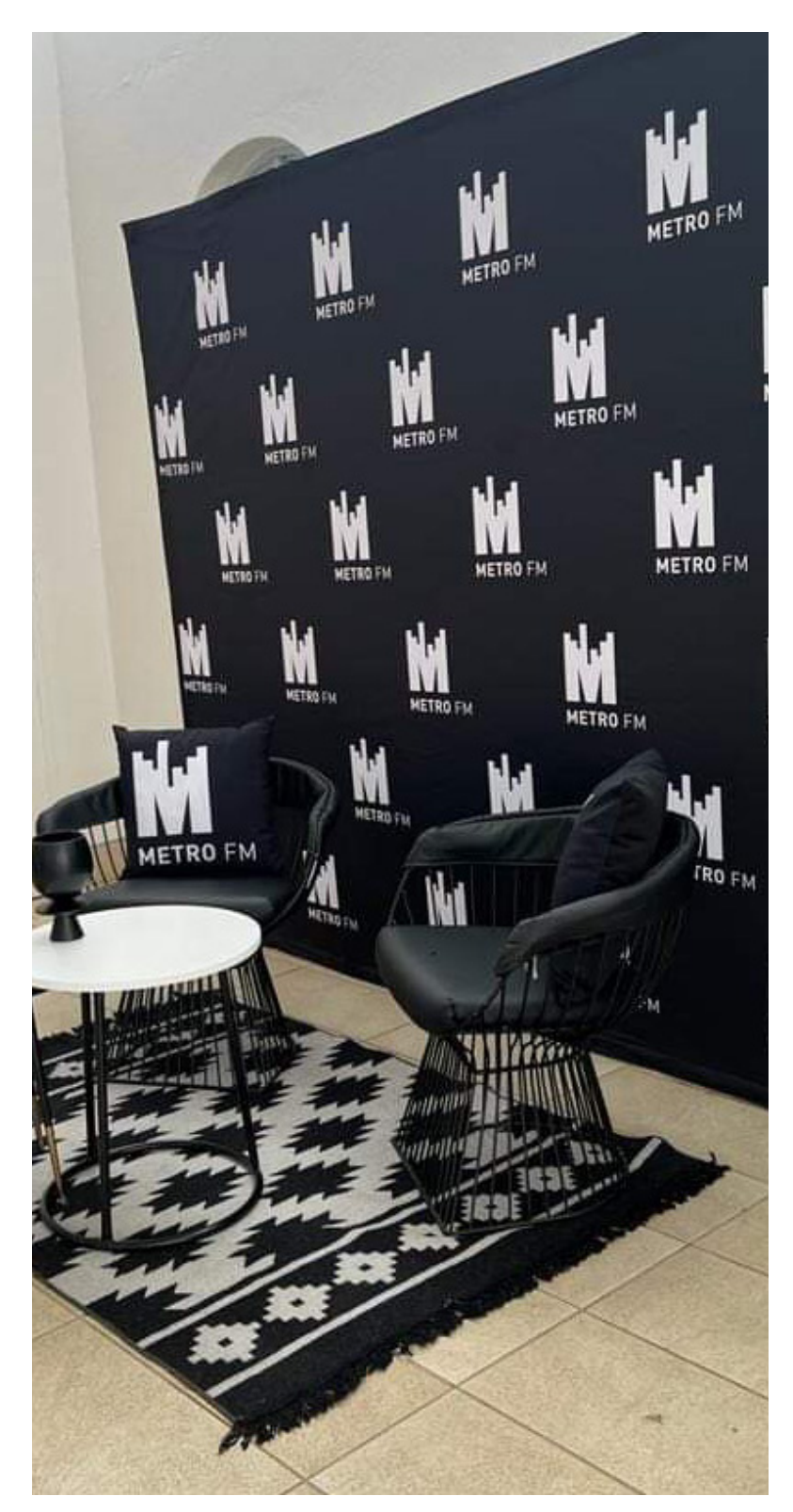
A set to mark the launch of the coveted Metro FM Awards.