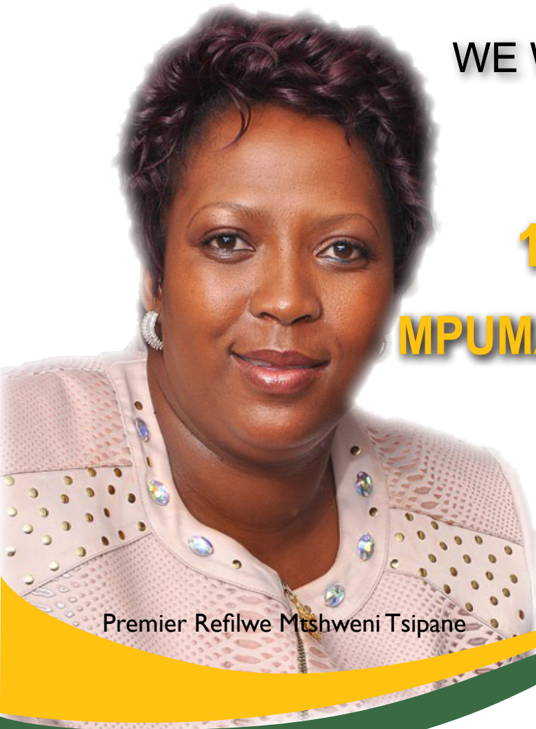
Premier Refilwe Mtshweni Tsipane