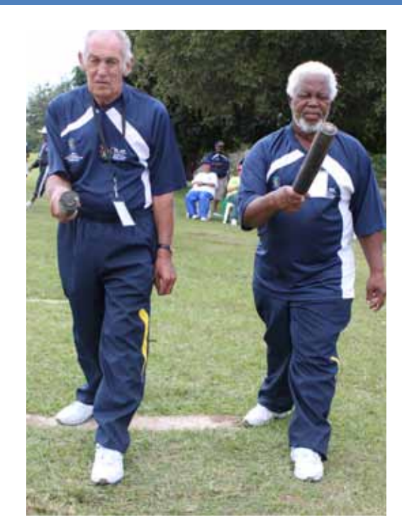
Senior citizens from Team Mpumalanga participting in Jukskei

At the tournament, winning is secondary. It is more about participation and promotion of active ageing for senior citizens. Team Mpumalanga managed to live up to