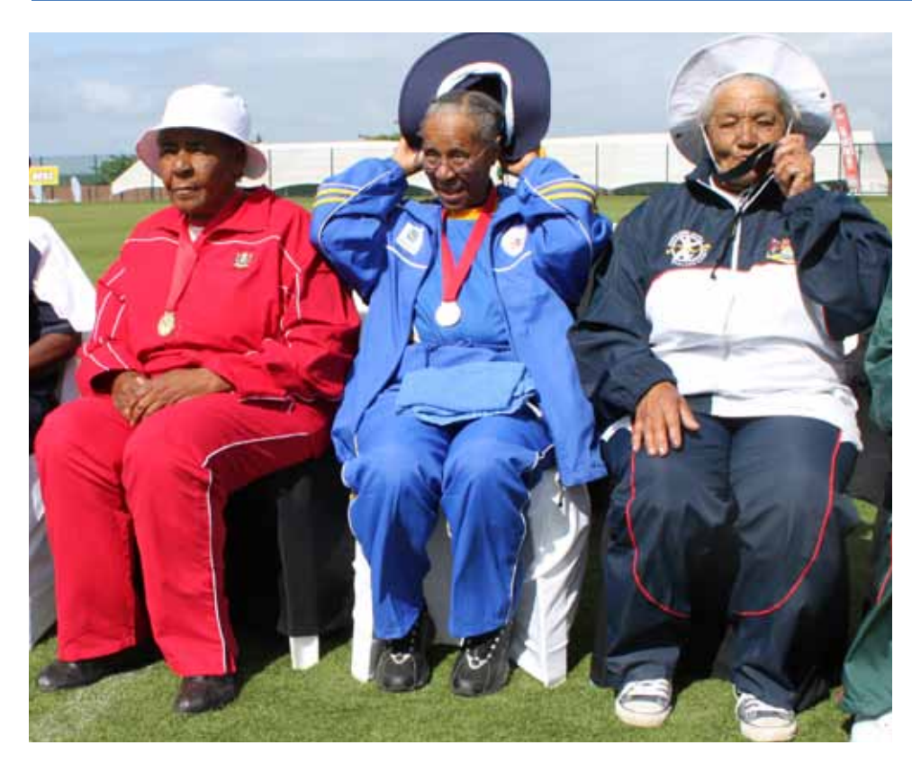
Senior citizens from all provinces attended the Golden Games

Richards Bay - Mpumalanga senior citizens exhibited amazing sporting skills at the recent National Golden Games Championships in Richards Bay