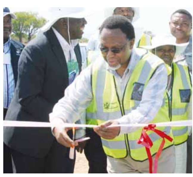
Deputy President Kgalema Motlanthe officially opening the Water Treatment Plant in Ntunda

visit the area to ensure progress is made.