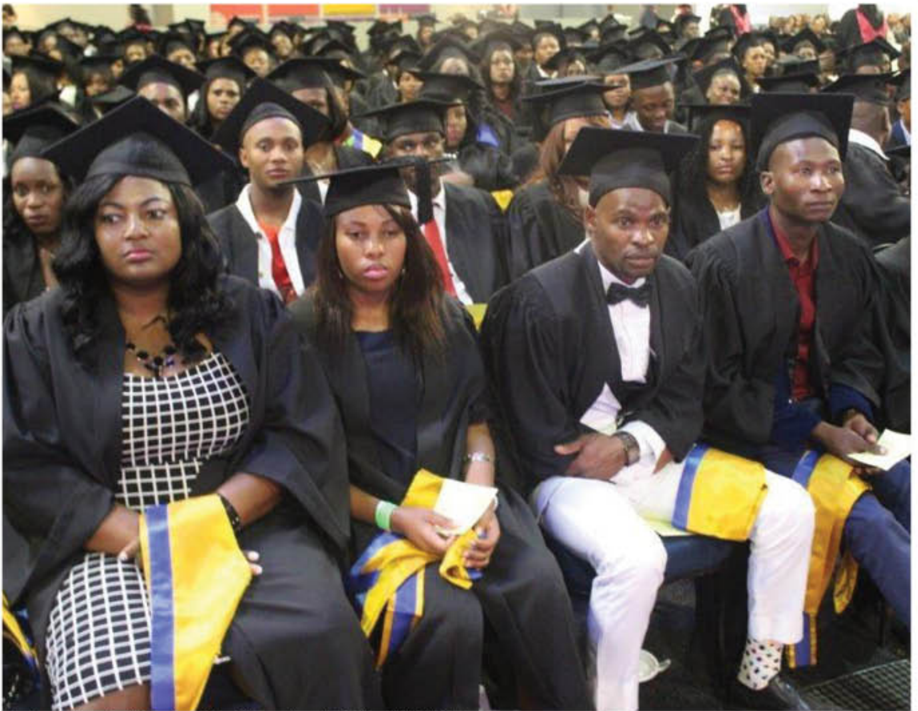
Class of 2016 graduates from the Mpumalanga College of Nursing ready to take their place in the health fraternity.