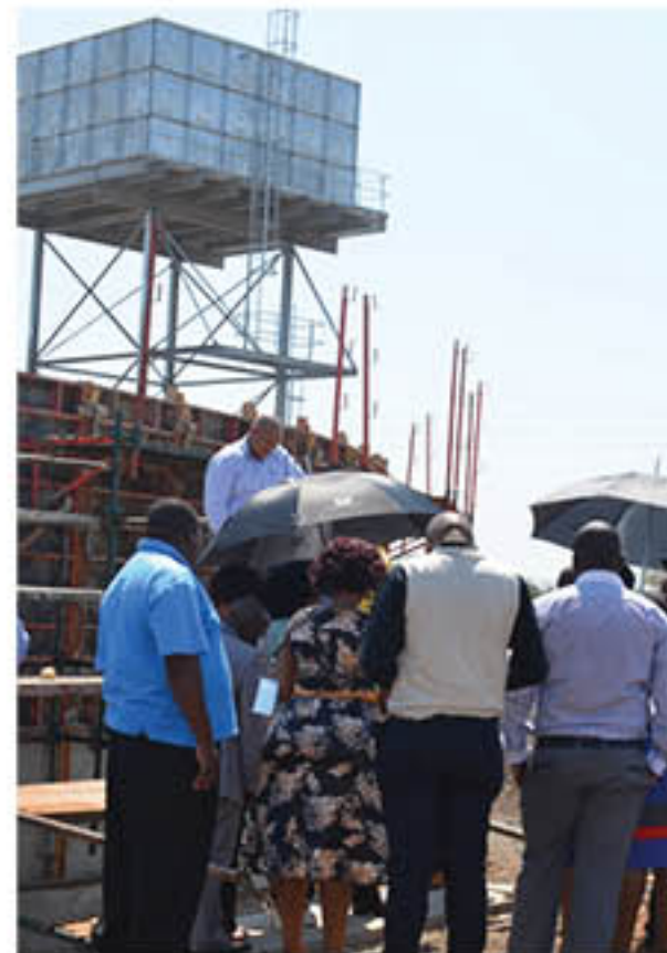
Water and sanitation a priority for the Department of Co-operative Governance and Traditional Affairs.

plan to support municipalities in the delivery of water.