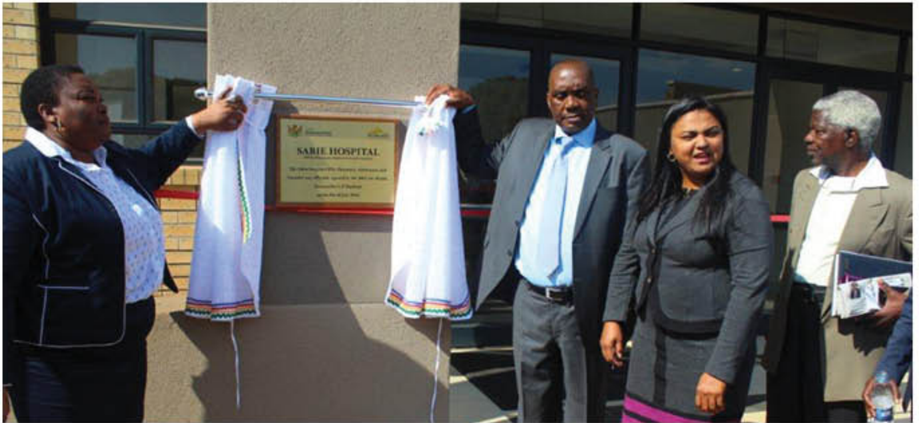
The MEC for Health, honourable G.P Mashego and the executive mayor of Thaba Chweu Municipality Cllr Selina Mashego-Sekgobela officially opened the New wing (OPD, Pharmacy, Admissions and Casualty) at Sabie hospital, Thaba Chweu