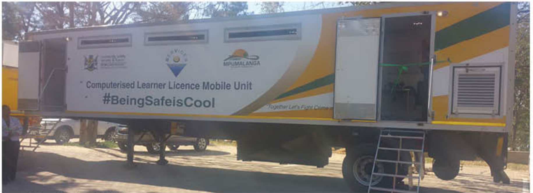
Computerised Learner Drivers Licence Mobile Unit.