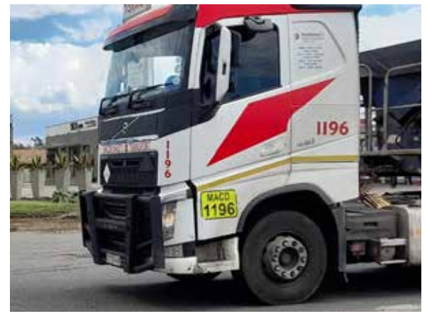
Truck drivers under Surveillance.

During the recent operation, members of Traffic Intervention Unit (TIU) stopped about 296 vehicles which include 171 heavy motor vehicles. Several summonses were issued for moving violations such as overtaking on a barrier line as well as vehicle defects that include worn out tyres and faulty lights.