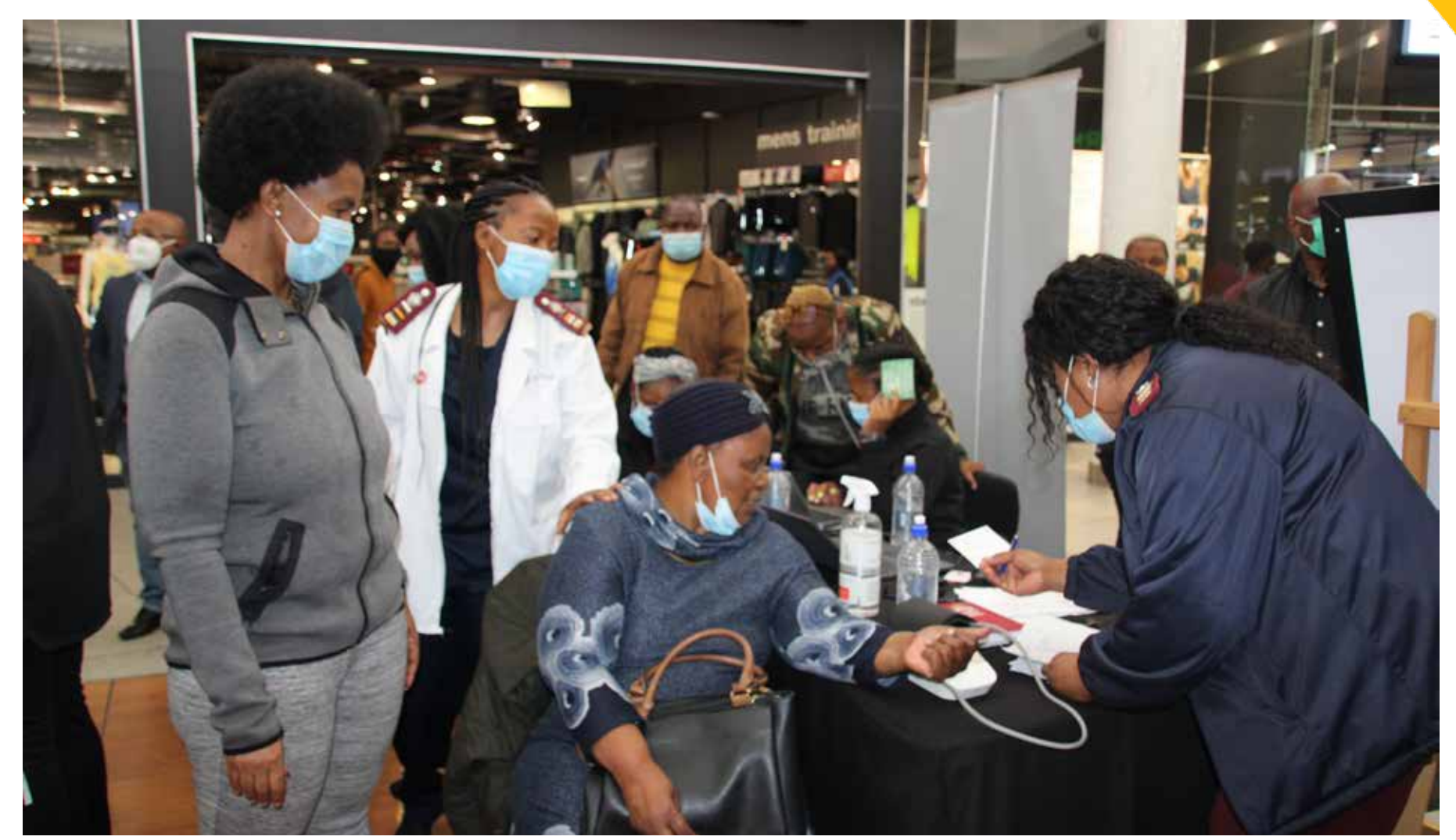
The Minister in the Presidency for Women, Youth and Persons with Disabilities Ms. Maite Nkoana-Mashabane encouraging the public to vaccinate during the Vooma Vaccination drive at Witbank Mall.