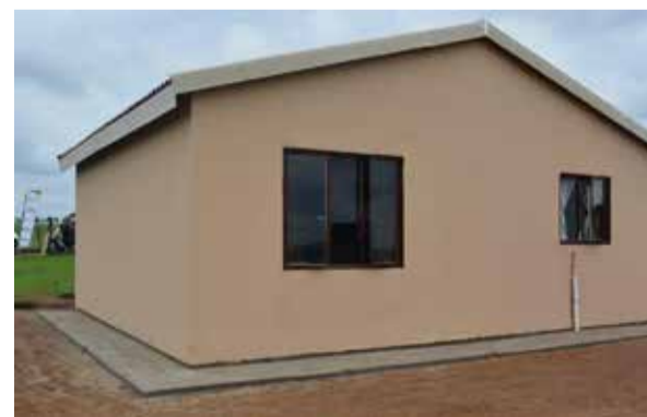
PERFECT: One of the houses delivered by Human Settlements at Saul Mkhize Villlage, Mkhondo Local Municipality.