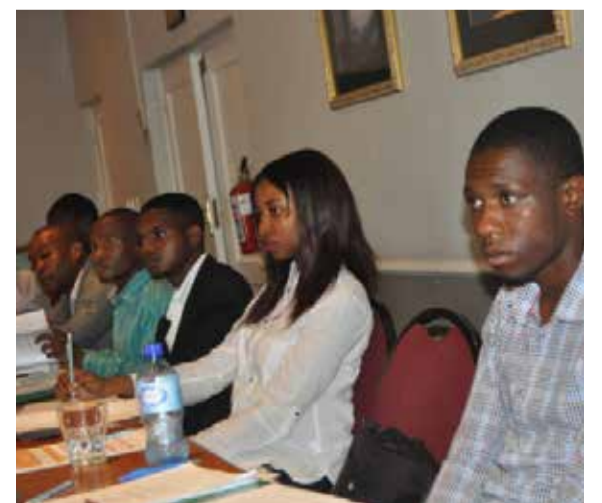
Graduates deployed to the municipalities by MISA

in pursuit of the service delivery goal to increase the number of people with access to water and electricity.