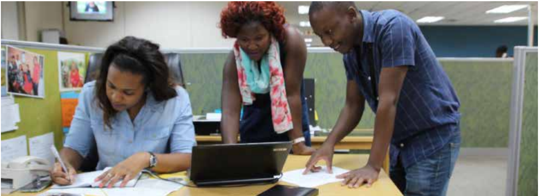
Some of the young graduates who are currently enrolled by the Department in the Internship Programme.