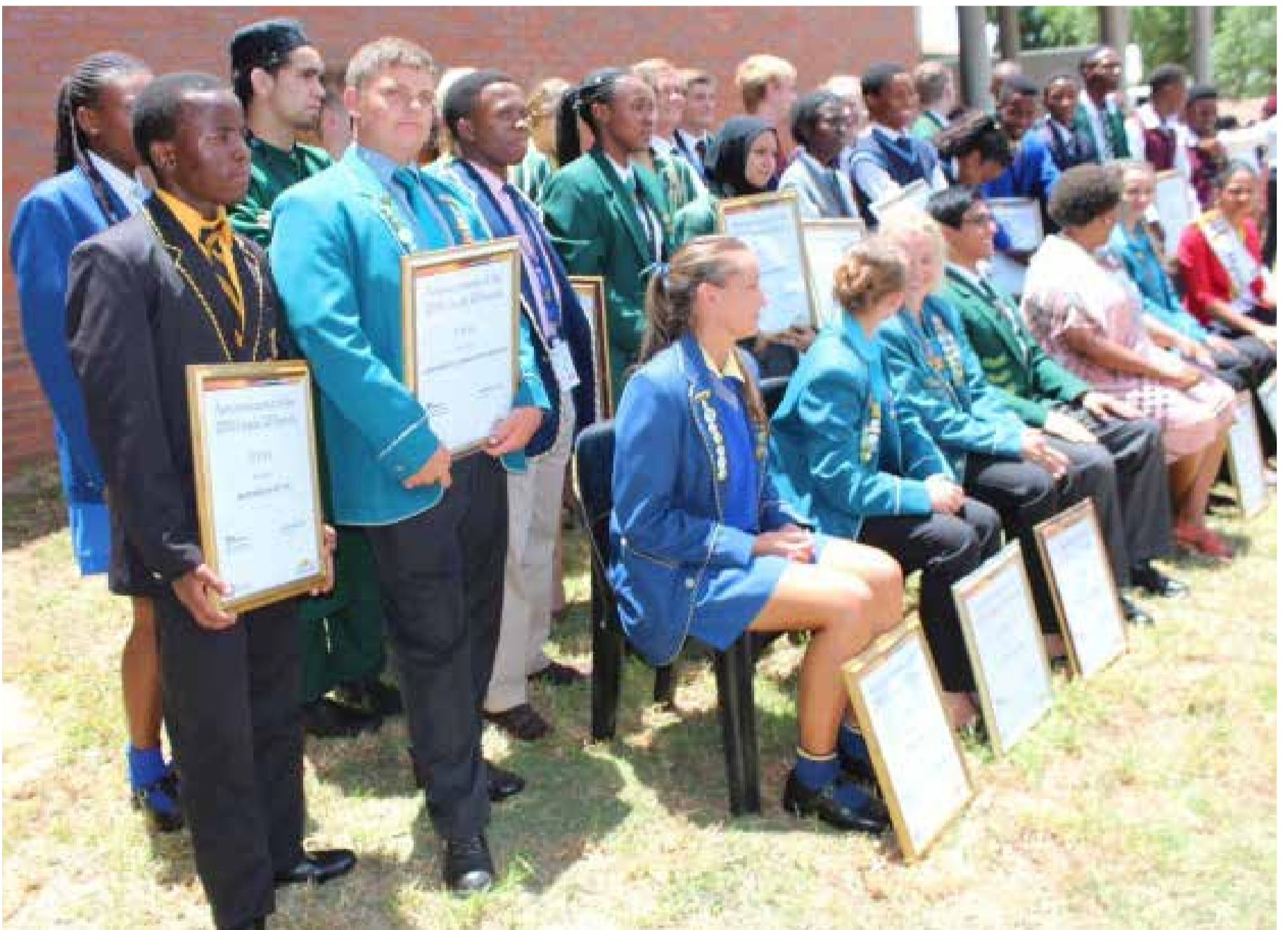
Celebrating Mpumalanga's top 40 Matric result achievers.

M pumalanga's 2016 matric pass rate has surpassed the national performance rate by far. The Province has achieved an average of 77.1% compared to the national's 72.5% pass rate.