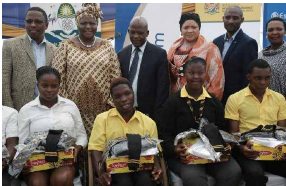
The One Million School shoes project, over the next 5 years was launched and undoubtedly this warmed the hearts of everyone.

The initiative was welcomed by the Department of Education as well as Eskom Kusile Power Station who also donated uniform packages. About 1500 school shoes, uniforms and stationary packs were donated to learners from 6 municipalities of the District.