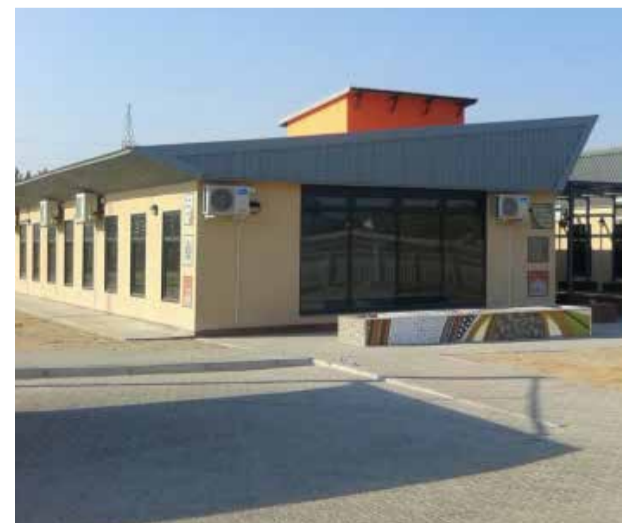
New Acornhoek Library.

many parts of the Province are already enjoying the fruits of the struggle waged by stalwarts like the late Dr Nelson Mandela, Oliver Reginald Tambo and many others.