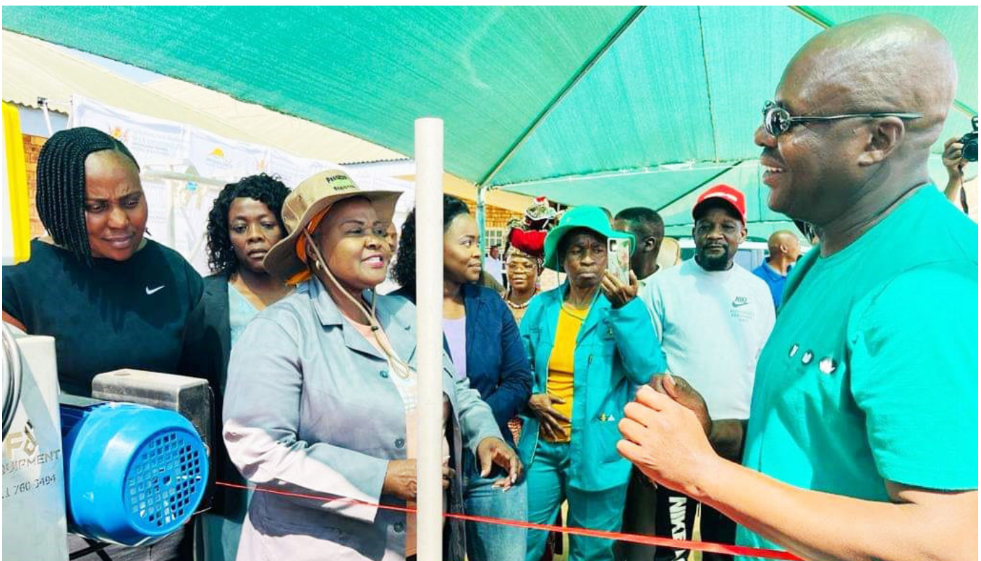
MEC Shiba of DARDLEA handing over a state of the art poultry processing equipment to the Nkanyezi Poultry project.

The support for the Nkanyezi project comes amid the Provincial Government's efforts to re-ignite the economy, through the Mpumalanga Economic Reconstruction Plan (MERP). It is envisaged that the agricultural sector, will contribute significantly to the much needed jobs, with a target of more or less 90 000 new and sustainable jobs, to achieve a 6% unemployment rate in 2030.