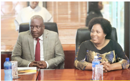
MEC Msibi and Premier Mtshweni-Tsipane in a jovial mood.

M pumalanga Premier, Ms Refilwe Mtshweni-Tsipane has made changes to the Provincial Cabinet. These changes include the appointment of two (2) new MECs as the Provincial Government accelerate plans to re-ignite the economy in the aftermath of the COVID-19 pandemic and to address infrastructure challenges and backlogs.