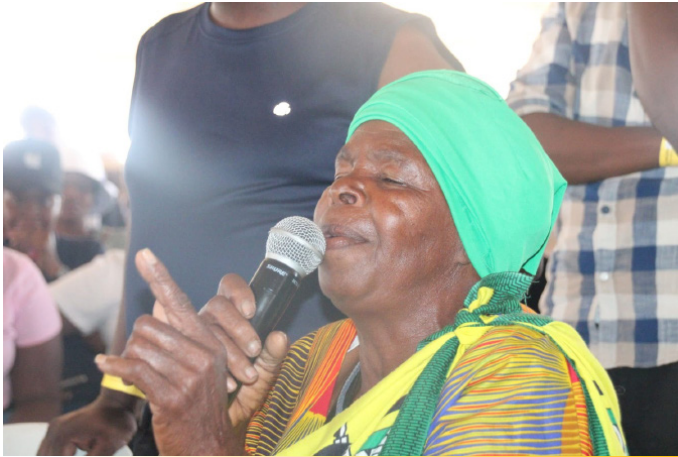
A local resident defining the acute water challenge in Dr JS Moroka Municipality