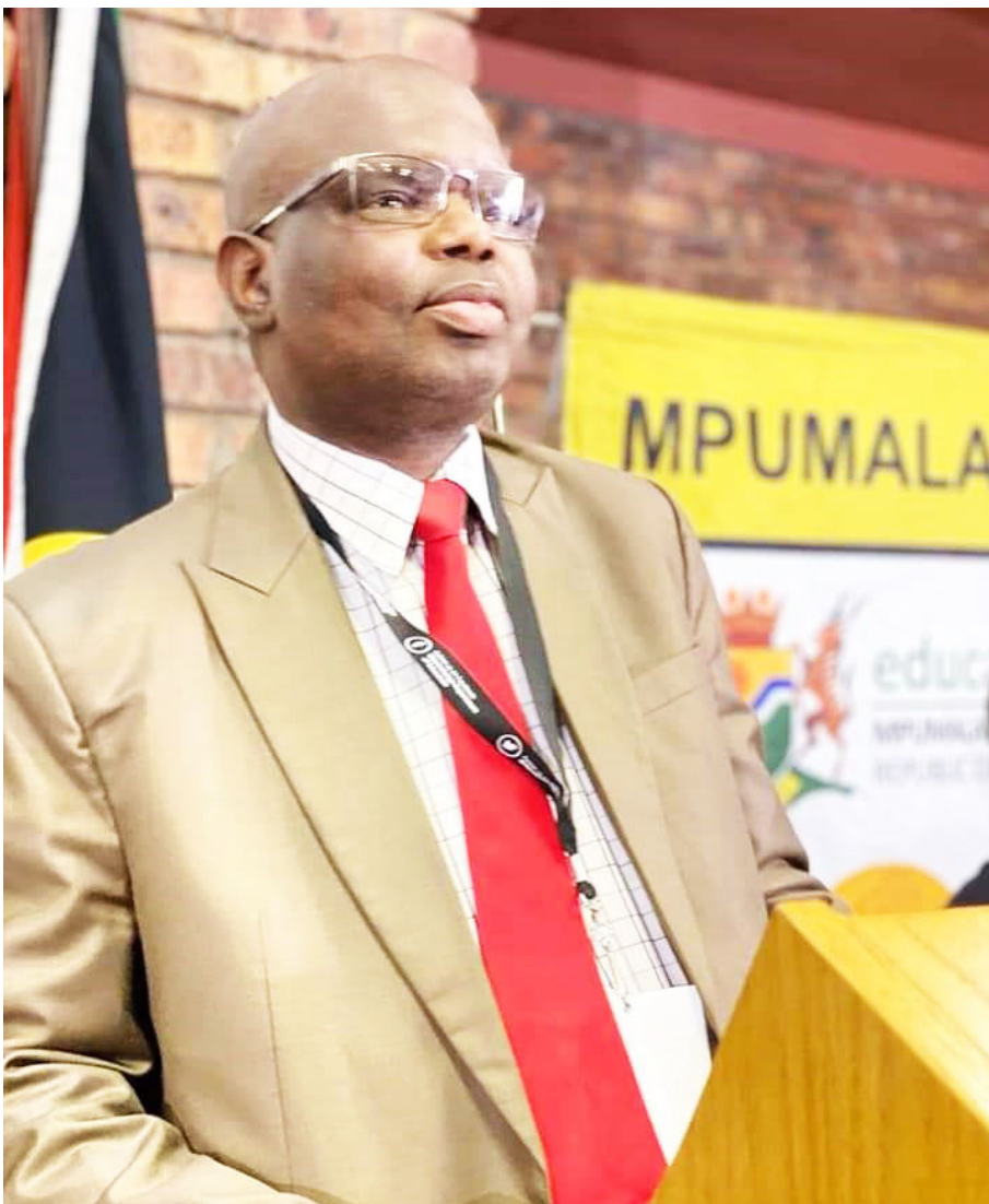
MEC Majuba advocates for a multi-sectoral approach as a measure to mitigate learner pregnancy in the provincial schools.

The Department views a multi-sectoral approach as a pillar to flatten the pregnancy rate. "The Department continues to sensitize parents