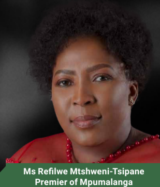
Ms Refilwe Mtshweni-Tsipane Premier of Mpumalanga

National Command Centre Toll Free Number: 0800 428 428